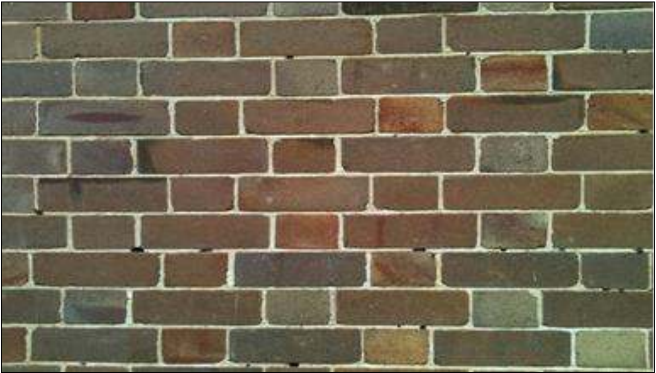
External Brickwork on Cottage at 12 Station Street Menangle 2016 (L Egan-Burt)

land’, would a desire for quality not have been encouraged by the Macarthurs and achieved by their trades and artisans? I believe the quality must have been of an extremely high standard. Menangle is a true tribute to this as the buildings have survived since the 1880s, despite various threats of residential and industrial change to the area.