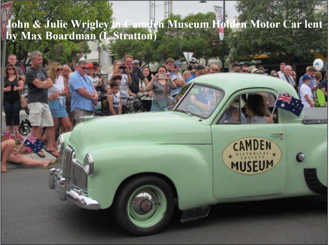
Crowds of enthusiastic onlookers at 2017 Camden Australia Day Parade at the corner John and Argyle Streets.