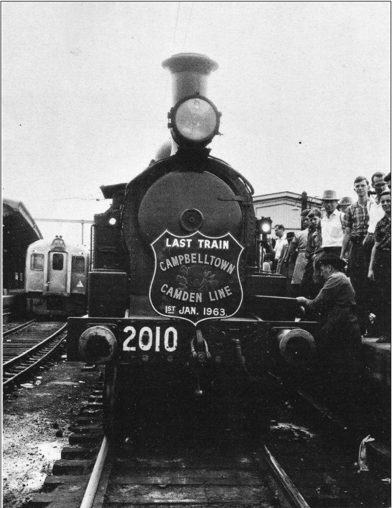
Pansy the last ride. This photograph was taken by Wayne Bearup on the day of the last Camden train in 1963 (W Bearup)