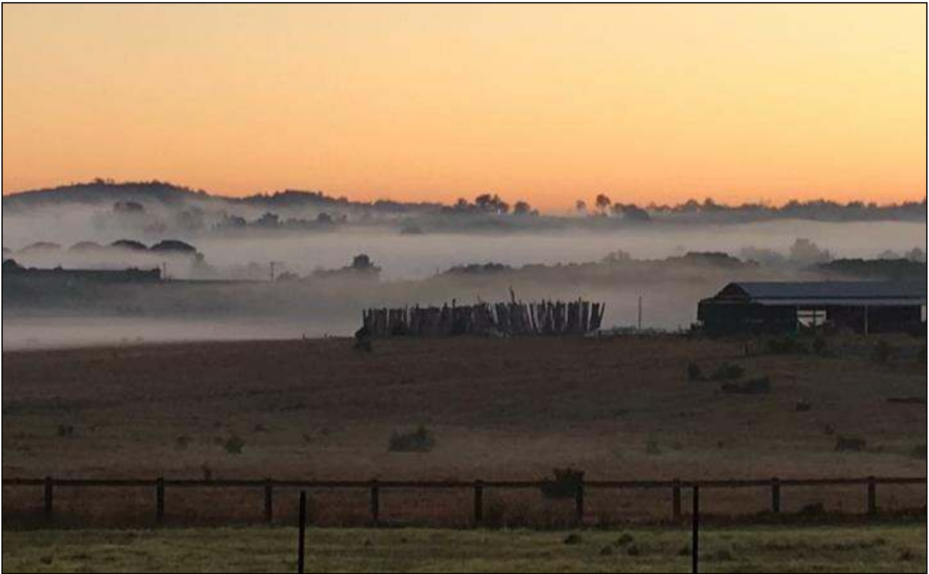
Rotolactor Paddock Menangle 2016 (L Egan-Burt)