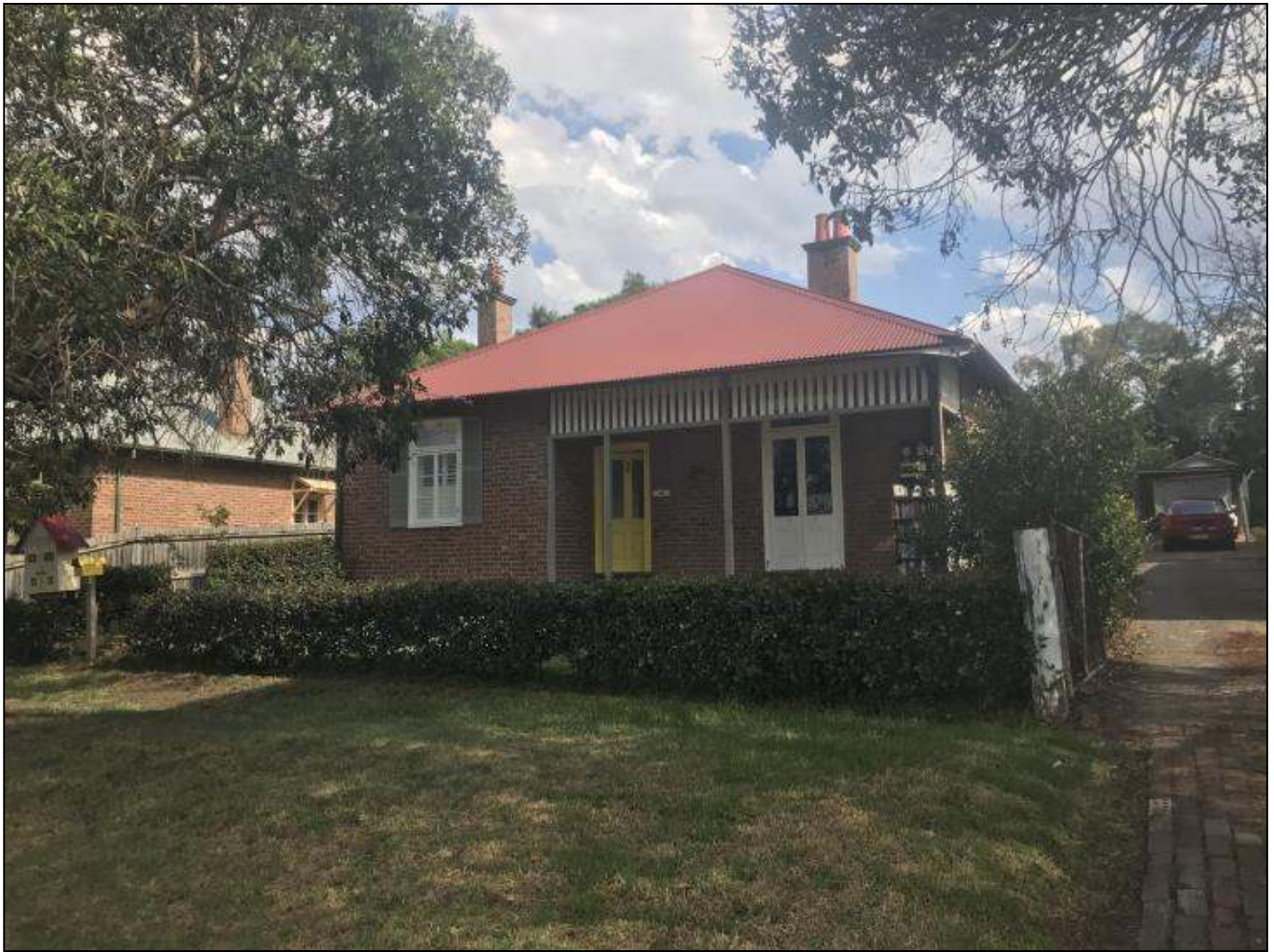
Egan-Burt Cottage at 12 Station Street Menangle 2017 (L Egan-Burt)

Indulge me as I examine just how viable my theory is, as I draw similarities between the church, the school and the house.