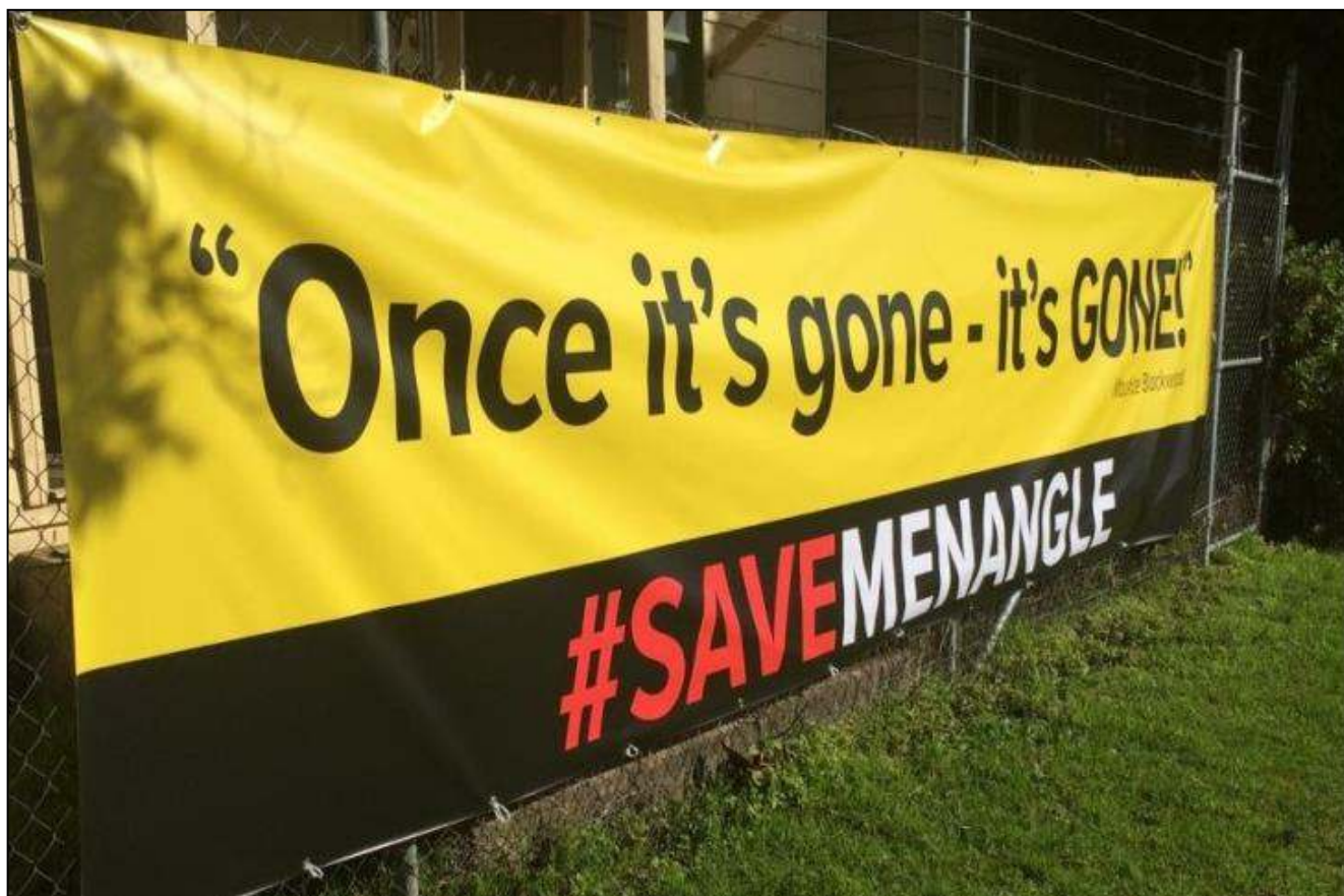
Banner for Menangle Community Association Inc #SAVEMENANGLE Campaign