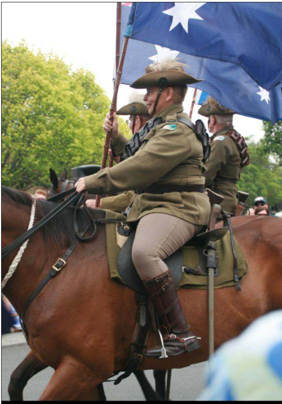
2017 Australia Day Parade Camden (A McIntosh)